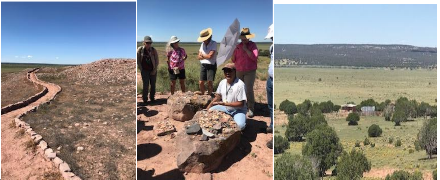
Picture on the left looking south shows trail along the site, middle picture shows samples of pottery that have been found on site, and picture on the right shows a view from the site looking southeast where Kenny's family still raise livestock.