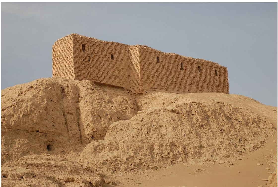
Ruins of a temple platform in Nippur - the brick structure on top was constructed by American archaeologists around 1900.

The Sasanian Period is known for great social stress caused by drought, famine, plague, and a huge population explosion. Lots of irrigation canals, requiring huge population shifts, were built, creating further stress to the population.