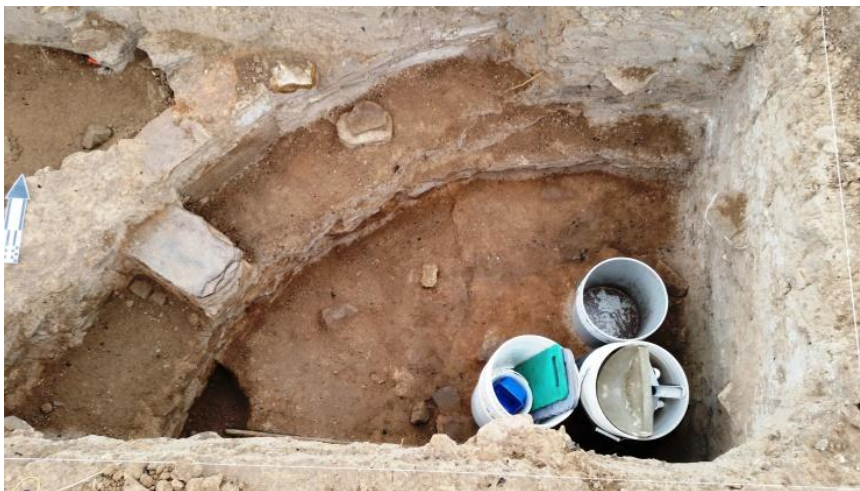
Figure 1 - Newly discovered kiva circa AD 1025

Thirty-four people (including Hisatsinom members Mary Gallagher, Karen Kinnear, and Tom & Terri Hoff) took part in the four-day Field Session at Mitchell Springs in August under the direction of Dave Dove. This year's work was focused on the eastern and southern side of Pueblo A, a 28-room two-story great house. An arc of Pueblo I surface rooms was discovered behind the previously excavated or tested Pueblo I pit structures PS 25, PS 27, and PS 28. This early pueblo extends beneath the great house and connects to another C-shaped Pueblo I pueblo that lies beneath the unusual tri-wall structure that is appended to the great house. A domestic living room in the new roomblock was found and approximately 20% was excavated. Like the PI rooms beneath and around the tri-wall, this room contains unusual green sand-filled floor features and a sipapu.